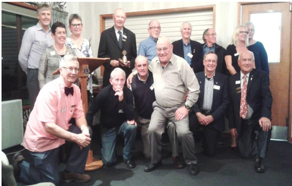
Incoming officers for Whangarei and Kamo